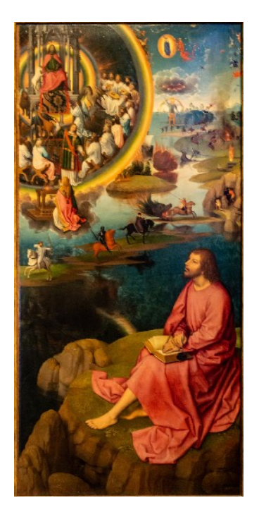
Christ Episcopal Church Roxbury, Connecticut

Fifth Sunday of Easter 15 May 2022, 9:00 AM